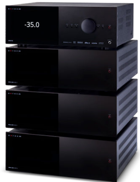
Three MCA 525s (Gen. 2) paired with an AVM 90 A/V Processor

Create Your Own Dolby Atmos 15-Channel System